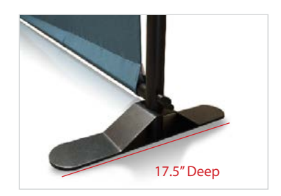
Sturdy Steel "Bridge" Support Base.