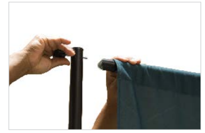
Clutch lock offers secure horizontal and vertical adjustments.