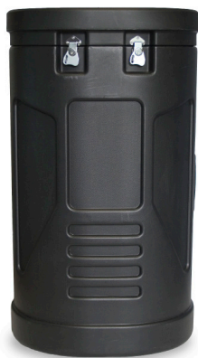
Medium Hard Case is included.