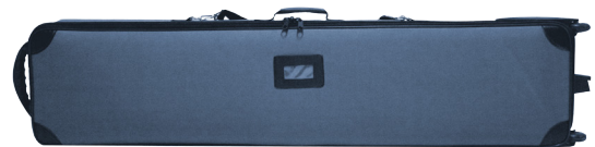
Snap Tube Silver Bag with wheels 47"Wx 10"H x 5"D (8 lbs)