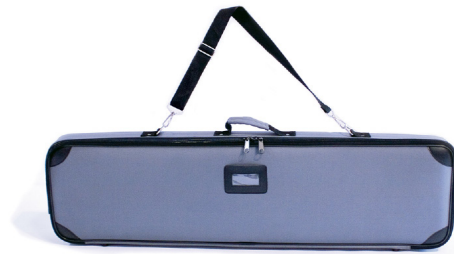
Snap Tube Tabletop Case (Included)