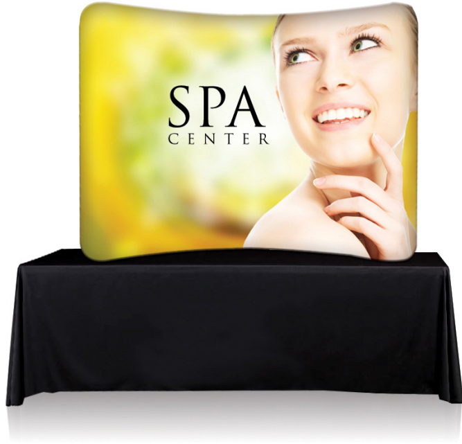
Table is not included.