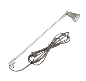
Optional Comet Silver Light - Small (50 W)