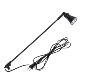
Optional Comet Black Light - Small (50 W)