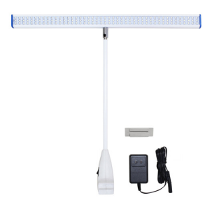
Optional Comet SEG Frame T135 LED Light