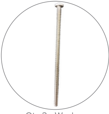
Qty 2 - Washer