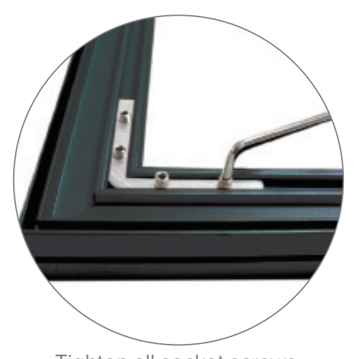
Tighten all socket screws.