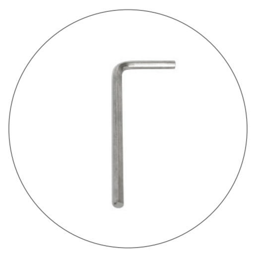
3mm Allen Wrench