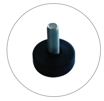
Qty 2 - Socket Screws