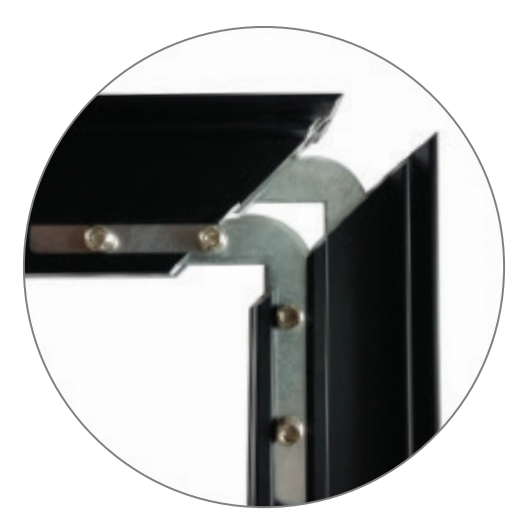
Insert adjacent extrusions together.