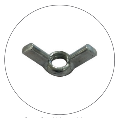
Qty 2 - Wing Nuts