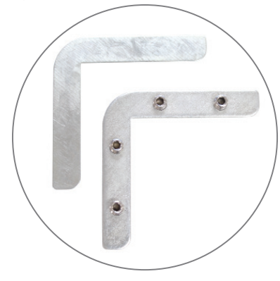
Qty 16 - Comet Corner Connectors