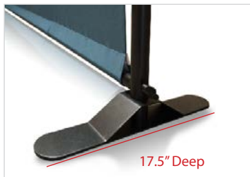
Sturdy Steel "Bridge" Support Base.