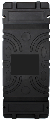
Wheeled Case (included)