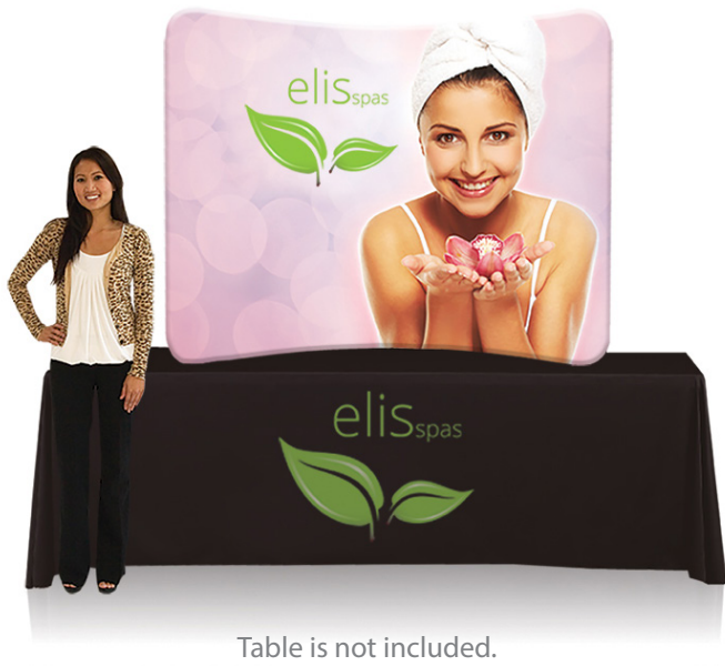
Table is not included.