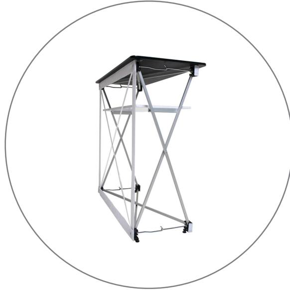
(Qty 1) Frame (Qty 1) Counter Top