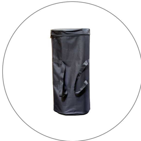
(Qty 1) Padded nylon travel bag